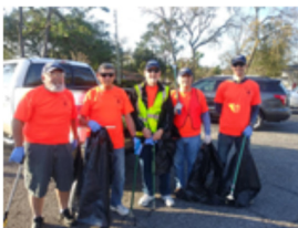
Road Cleanup Crew of Lone Star Rd.